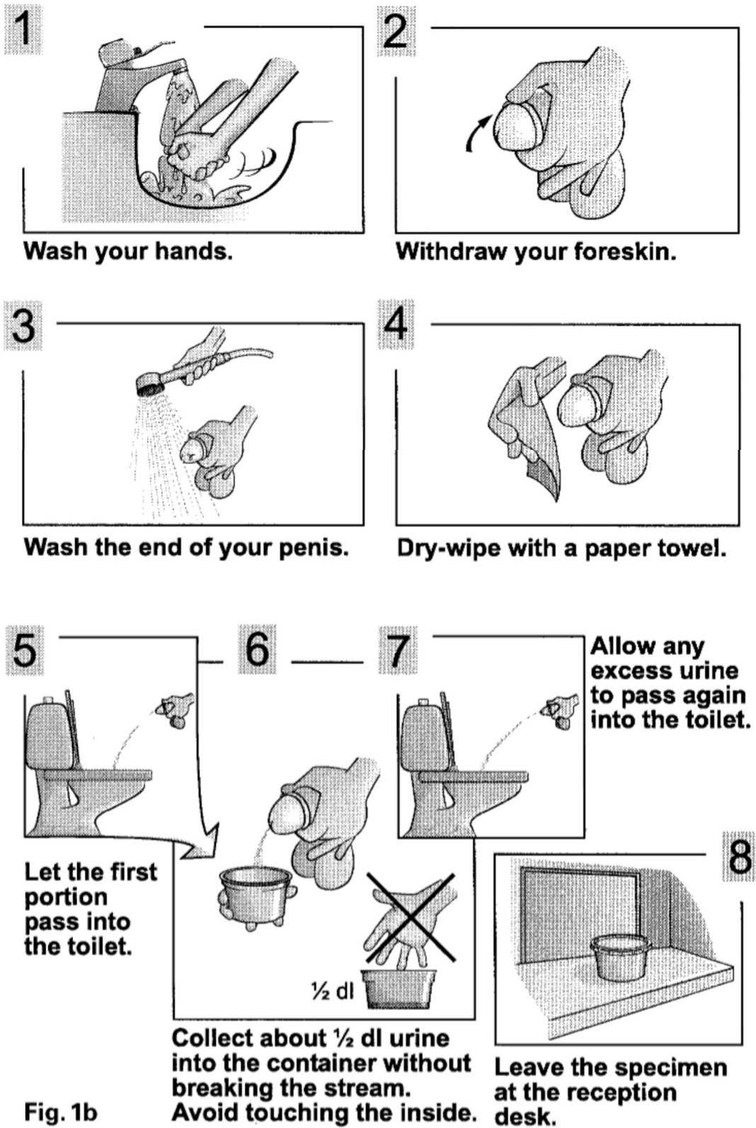
FIG. 1. Collection of mid-stream urine by females (1a) and males (1b) by washing genital organs with a shower. (Published with the permission of Tampere University Hospital.).